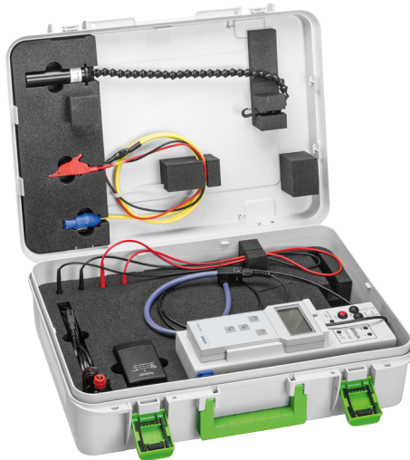
Figure: KSG 200 TA (with battery)