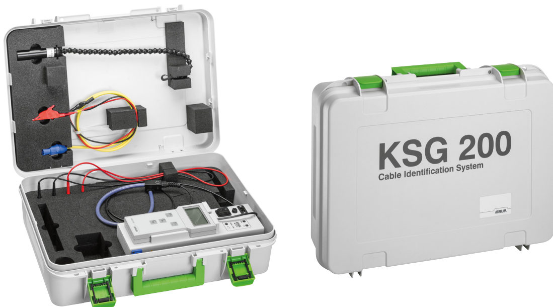
Figure: KSG 200 T (without battery)